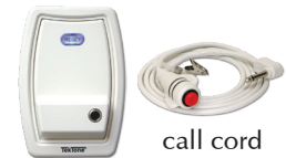
single room station