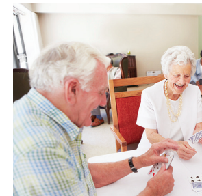
CONTINUING CARE RETIREMENT COMMUNITIES / LIFE PLAN