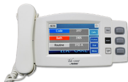
touchscreen master station, with optional handset kit

The Tek-CARE®160 is a modern and affordable nurse call system that is easy to install, use, and maintain. Featuring customizable peripheral devices, sleek, touchscreen master stations and high-quality two-way voice communication, the Tek-CARE160 is designed to meet the needs of facilities across the entire healthcare spectrum.