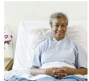
AMBULATORY SURGERY CENTERS