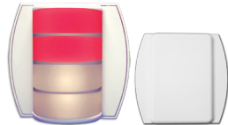
station controllers with & without dome light