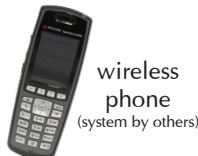
wireless phone (system by others)