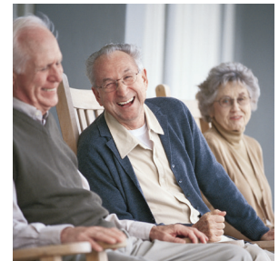
ASSISTED / INDEPENDENT LIVING