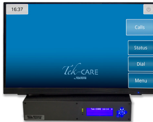
Tek-CARE®700 event monitor (runs on Tek-CARE® Appliance Server)

The Tek-CARE®700 wander management system gives Alzheimer's, dementia and other at-risk residents the ability to move freely about a facility, while preventing them from leaving or wandering into dangerous areas. Tek-CARE®700 runs on our Tek-CARE® Appliance Server, and provides resident ID, loiter and door-ajar monitoring, low tag battery and other alerts.