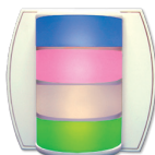
corridor dome light