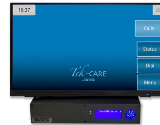
Tek-CARE® Appliance Server

Smart phones, pagers and email can easily be included to ensure that the right staff member receives the right event notification at the right time.