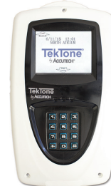
keypad with display