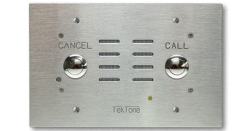
vandal-resistant/ psychiatric staff station