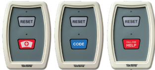
customizable 2-button pull-cord stations