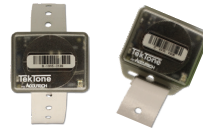
resident tag and asset tag