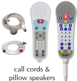
call cords & pillow speakers