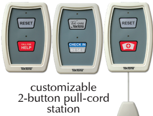
customizable 2-button pull-cord station