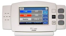
touchscreen master station, wall and desk mount options